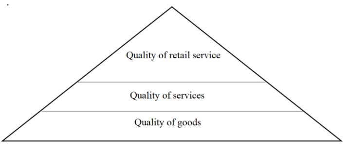
Figure 2. The "Pyramid" of the components of the quality of retail services.

Figure 2 shows the "pyramid" of the components of the quality of trading services. It demonstrates that the most important component in this "pyramid" is the quality of the goods sold by the store. If the product is of poor quality, no high-quality trading service can ensure customer satisfaction and the formation of a positive image of the store.